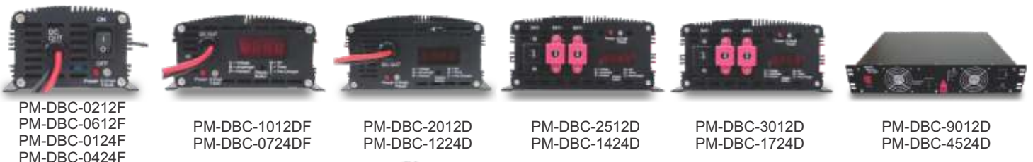
PM-DBC-0212F PM-DBC-0612F PM-DBC-0124F PM-DBC-0424F